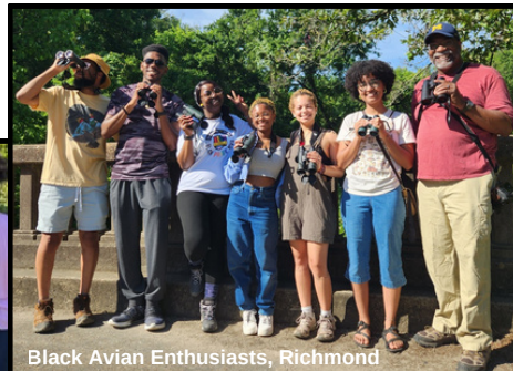
Black Avian Enthusiasts, Richmond