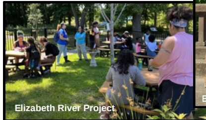
Elizabeth River Project