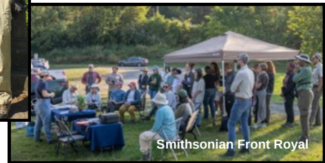
Smithsonian Front Royal

VSO grants have supported a diversity of birding activities by a diversity of groups