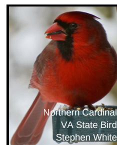
Northern Cardinal VA State Bird

* A non-profit, volunteer organization dedicated to the conservation of Virginia's birds through research and education, and by connecting people of all genders, races, identities, and abilities who enjoy birds. See https://www.virginiabirds.org/