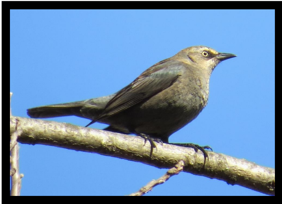
Rusty Blackbird – Lake Shenandoah, February 23, 2025