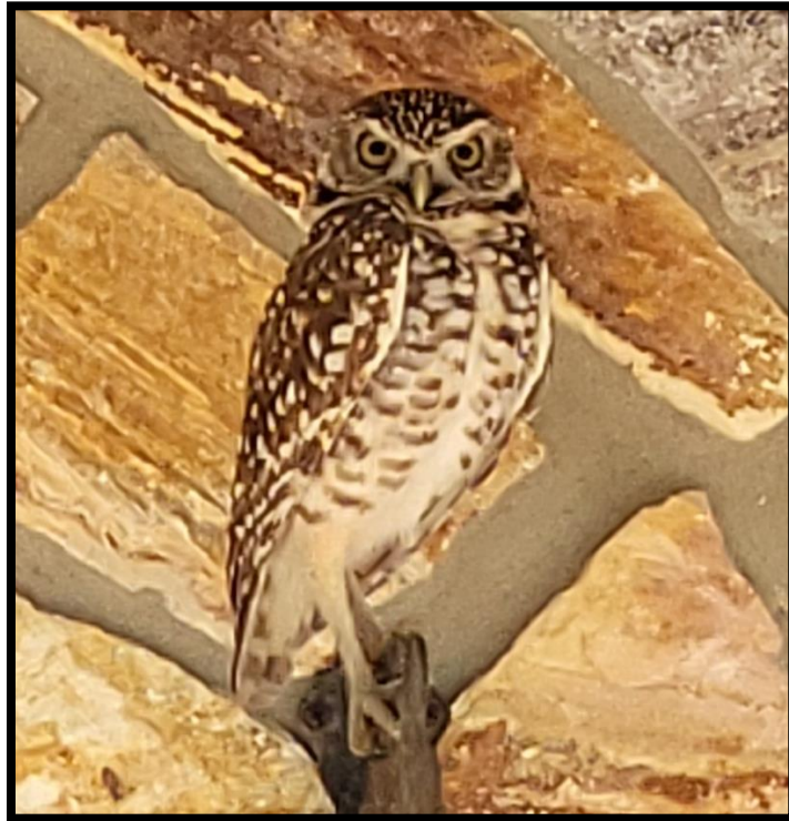
Burrowing Owl – Marco Island, Florida, November 15, 2024