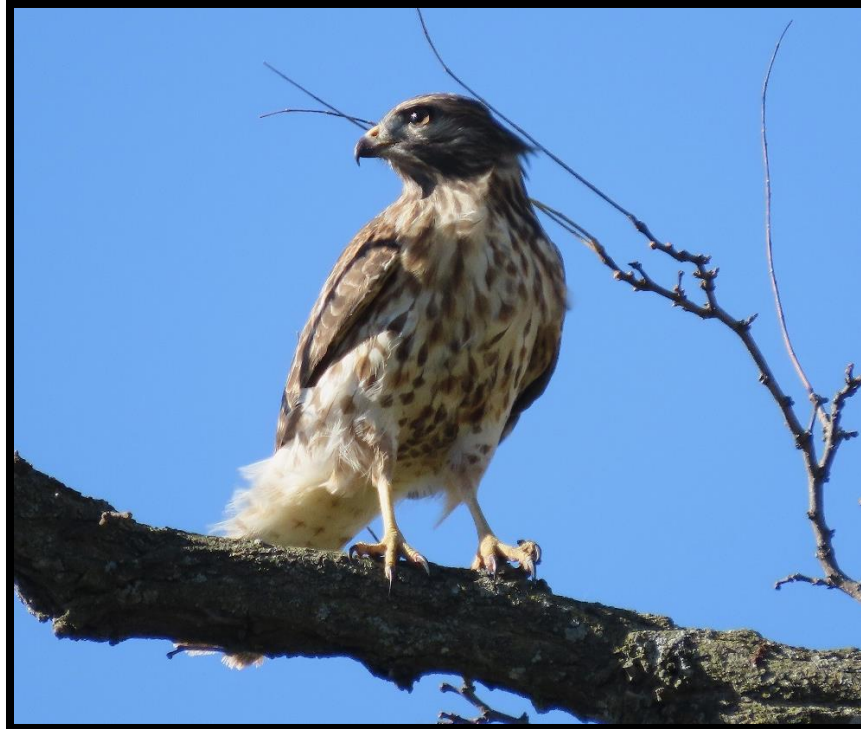
Red-shouldered Hawk – Hillendale Park, November 12, 2024