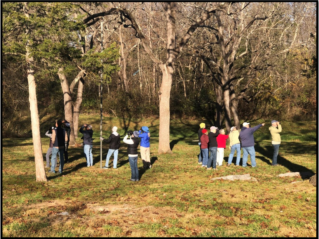
Textbook searching pattern was “seven look left and seven look right” at Hillendale Park on November 12, 2024.