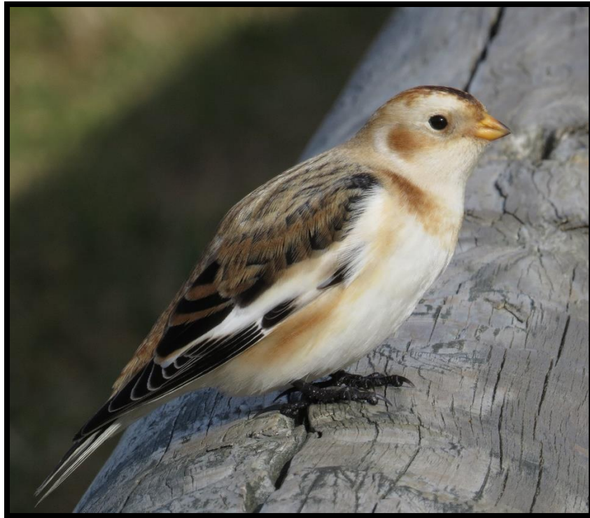
Snow Bunting – Franklin Cliffs Overlook on Skyline Drive, November 17, 2024