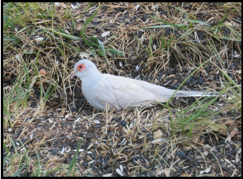
Diamond Dove – Harrisonburg, June 27, 2024