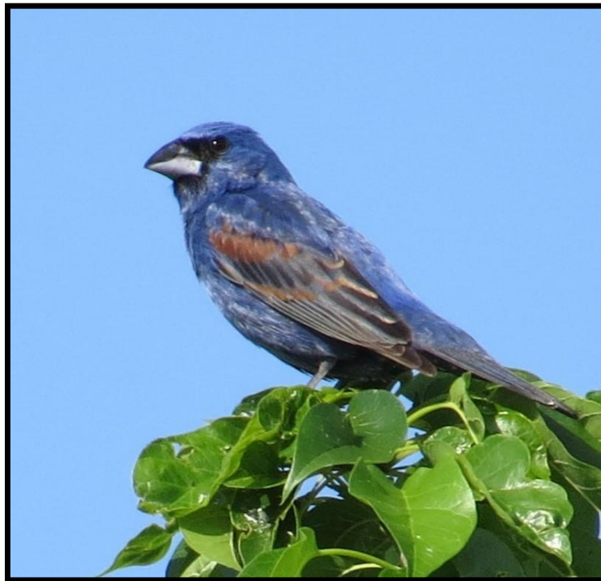
Blue Grosbeak – Northend Greenway, on June 16, 2024