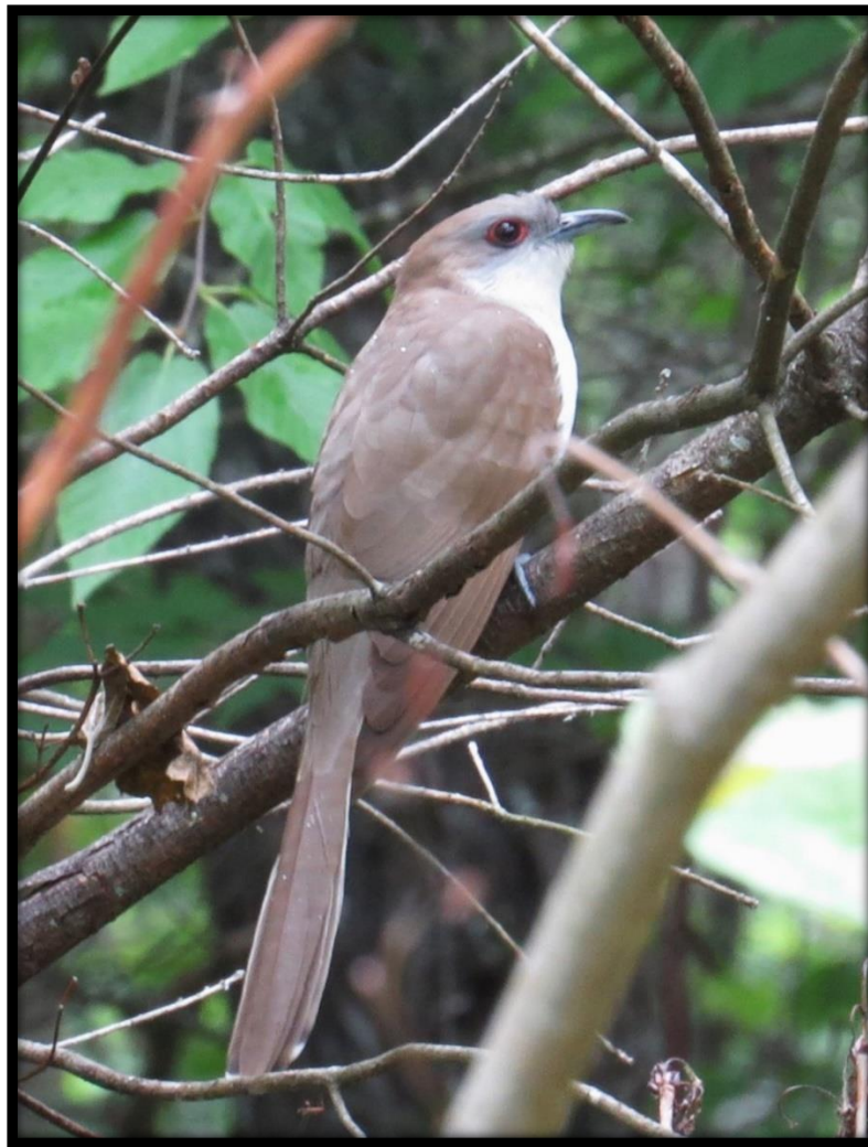
Black-billed Cuckoo – Switzer Dam on June 2, 2024