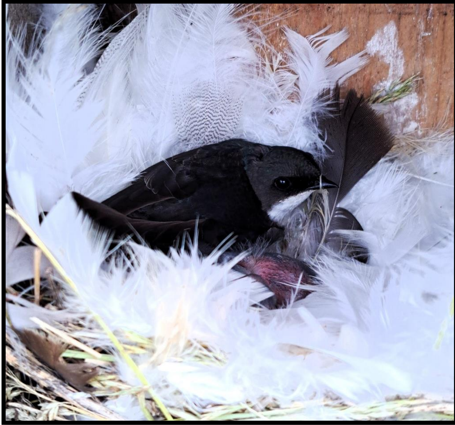
Tree Swallow in nest with hatchlings – Nest box at Rockingham County Fairgrounds Bluebird Trail, June 2024