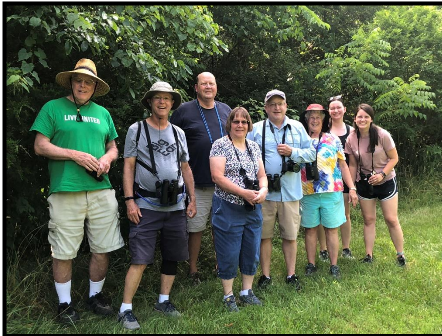
Happy Birders at Hillandale Park, June 20, 2024