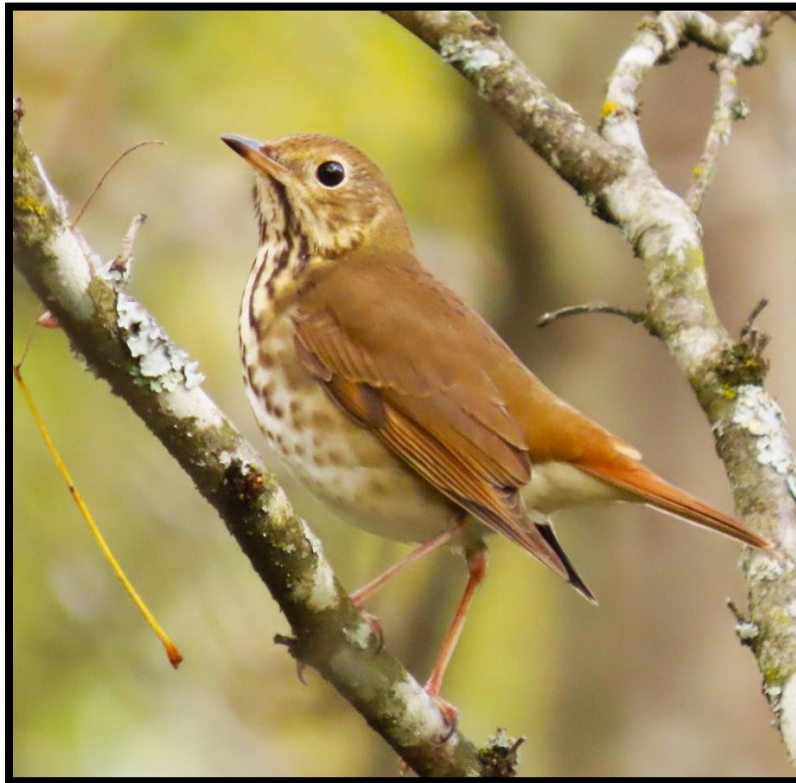
Hermit Thrush – Hillandale Park, Oct 15, 2023