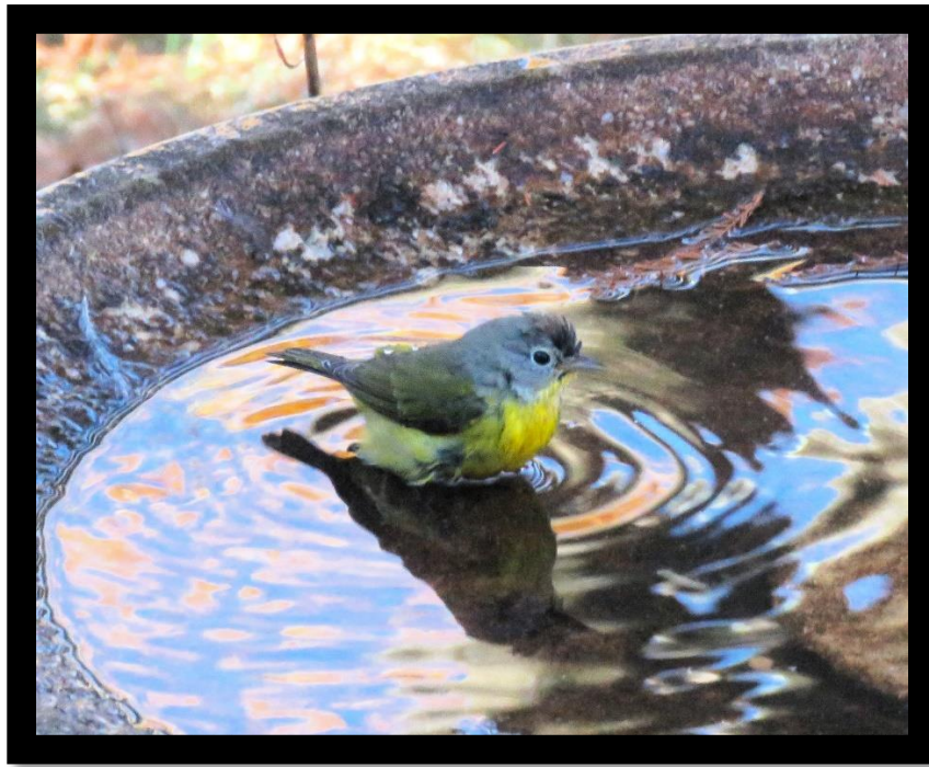
Nashville Warbler – Harrisonburg, Oct 25, 2023