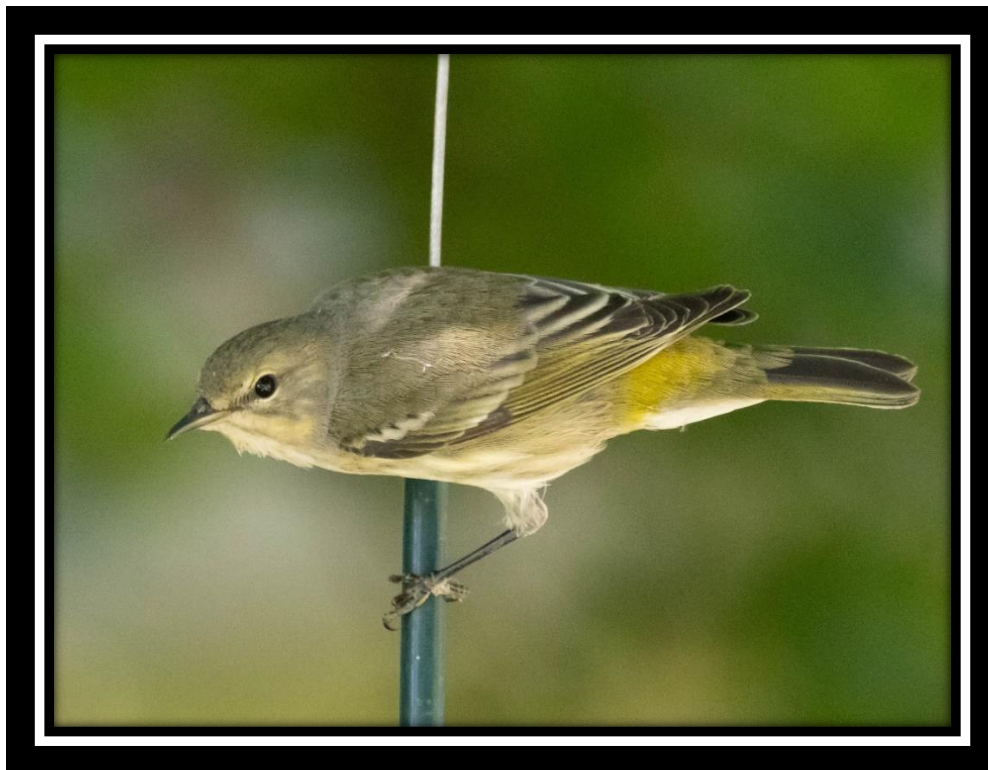
Cape May Warbler checking out bird feeders.