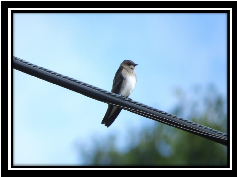
Norther Rough-winged Swallow – Happy Valley Rd, Keezletown