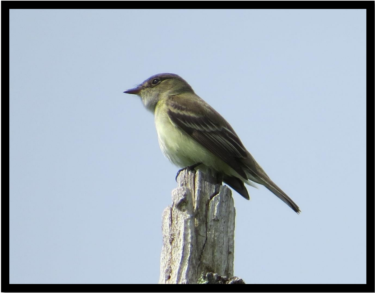
Alder Flycatcher – FR 539 Hone Quarry Ridge Road – June 11, 2023