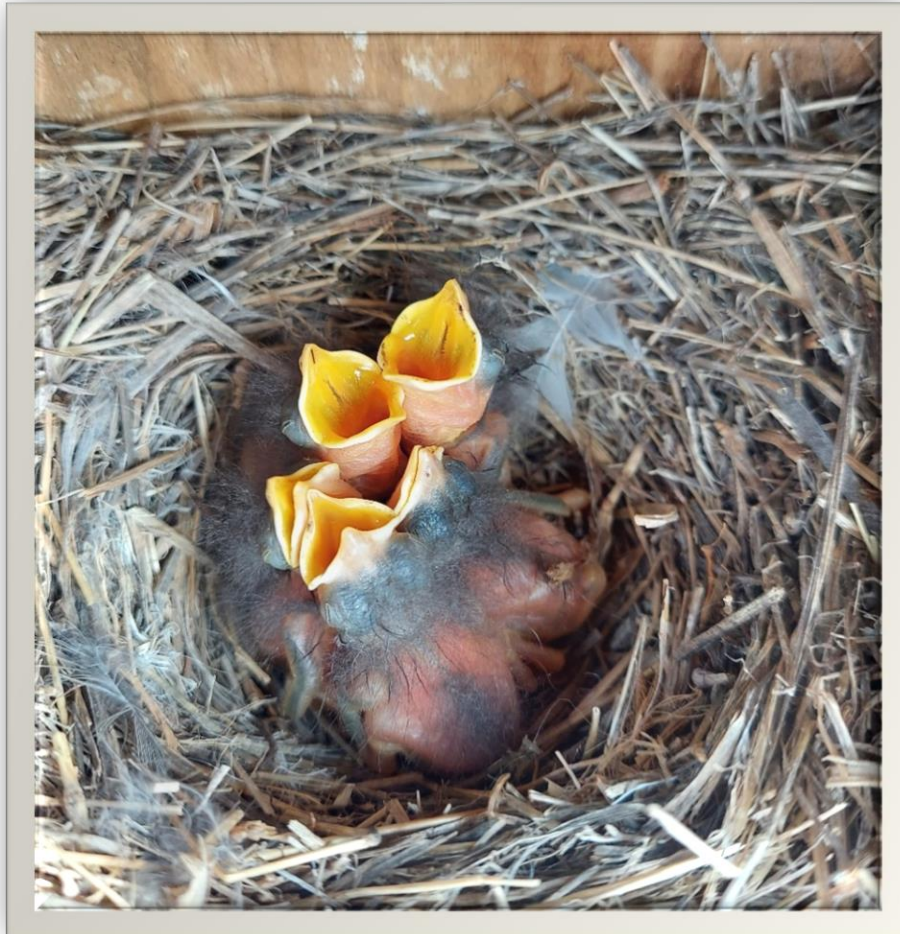
Bluebird nestlings in RBC Box #10 at the Rockingham Fairgrounds – May 14, 2023