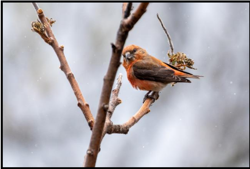
Red Crossbill – Briery Branch/Bother Knob Area, May 3, 2023