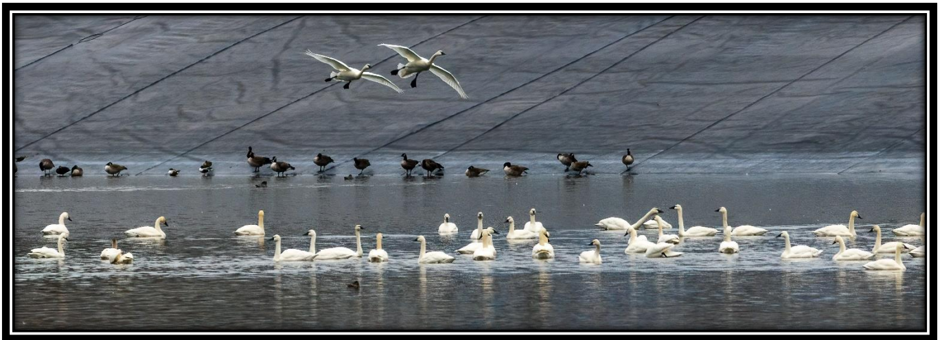
Photo above and two photos below: Tundra Swans at the Broadway Wastewater Treatment Plant, February 25, 2023

Book info - https://www.goodreads.com/en/book/show/23719330 . (Next meeting, April 20, we'll read "Fuzz" by Mary Roach.)