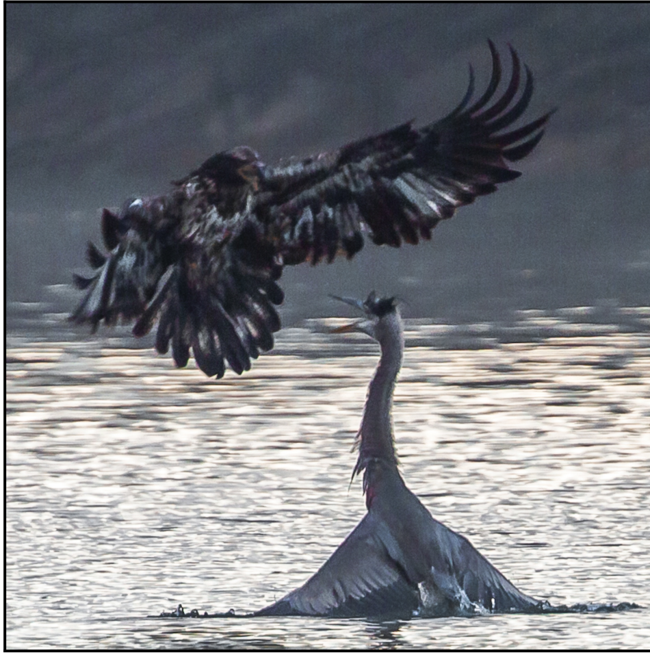
Immature Bald Eagle making an unsuccessful attempt at a Great Blue Heron meal - Lake Shenandoah, Jan 23, 2023