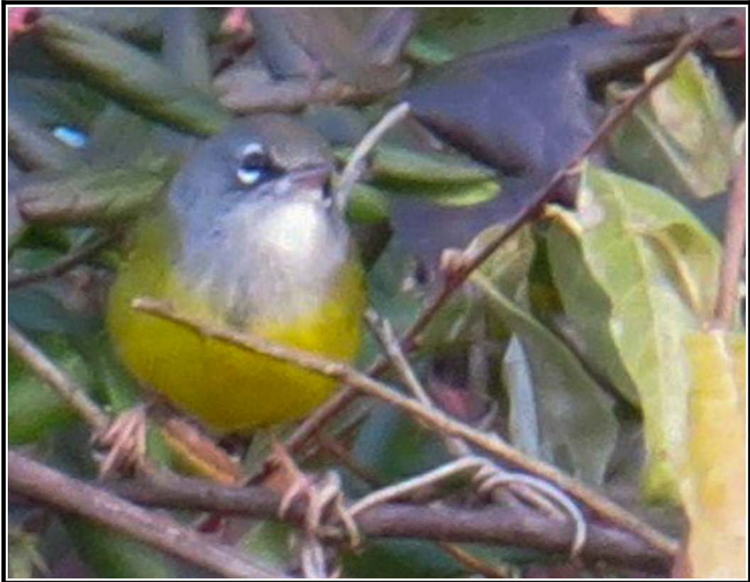
Very Rare MacGillivray's Warbler at Lake Shenandoah, November 28, 2022