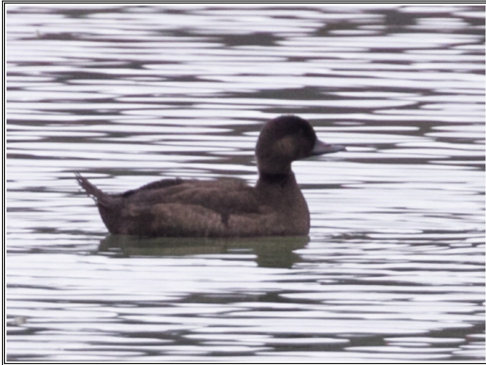
Black Scoter, Lake Shenandoah