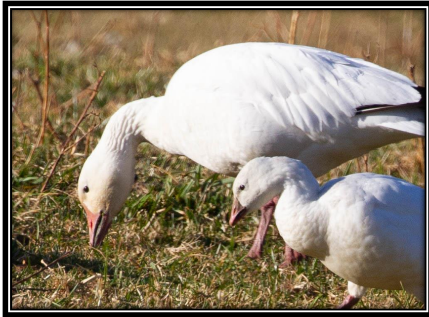
Ross's Goose with Snow Goose, Dec 16, Nazarene Wetlands