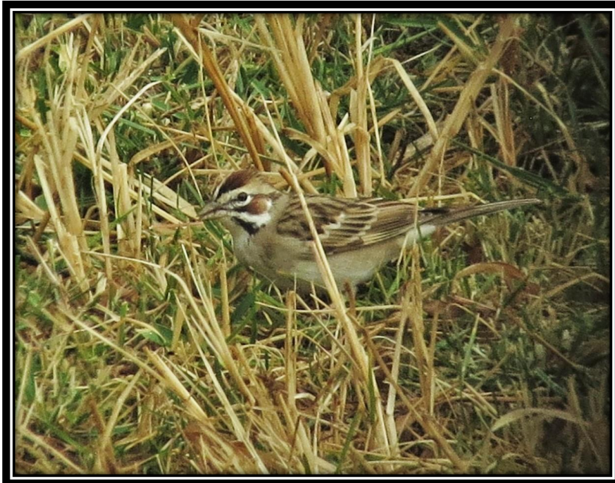
Lark Sparrow on Wengers Mill Rd – January 1, 2022