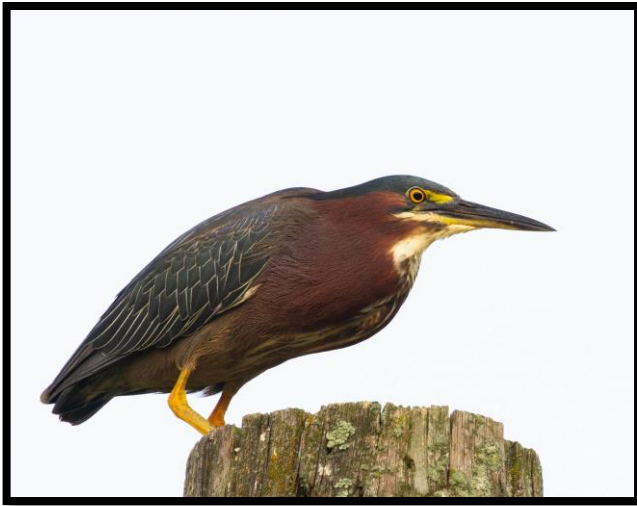
Green Heron – Lake Shenandoah – July 2021