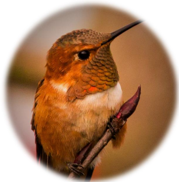
Rufous Hummingbird – Spring Creek – Oct 2020

Do you like to shop on Amazon.com? Do you like to support your local bird club? Now you can do both at the same time! Just visit AmazonSmile and select the Rockingham Bird Club as your charity of choice. Remember to go to https://smile.amazon.com/ to do your Amazon shopping. The Rockingham Bird Club will earn a percentage from the purchases you make. It is absolutely FREE to you and does not increase the cost of what you buy in any way.