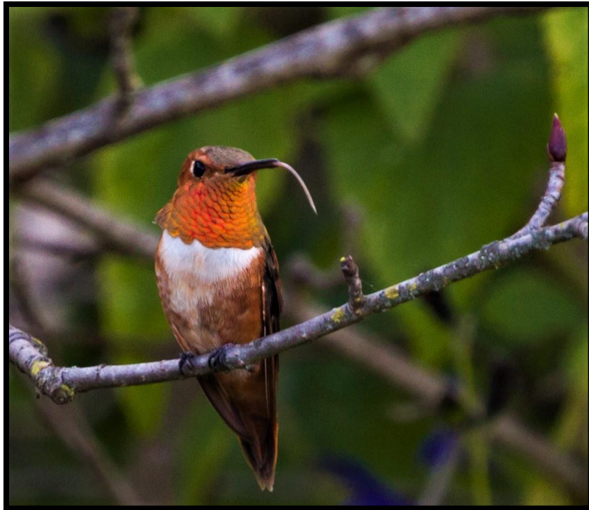
Rufous Hummingbird – Spring Creek – Oct 2020